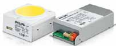
Fortimo LED DLM System

Legend: Green shaded boxes indicate that this SynJet product will properly cool the Fortimo. X indicates the optimal Cooler for this specific Fortimo version as recommended by Nuventix. Θ (Theta) - Thermal resistance defined as the delta in temperature divided by power (watts).