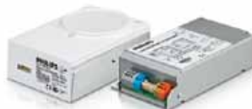
Lexel LED DLM System